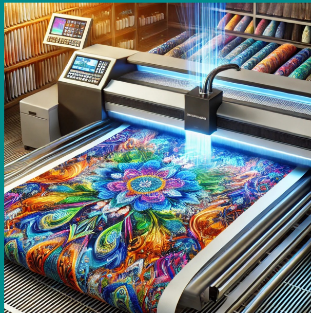
DIGITAL TEXTILE PRINTING

Our aqueous inkjet pigment colorants are designed for digital textile, office, and package printing applications, providing vibrant and high-quality inks for diverse printing needs.